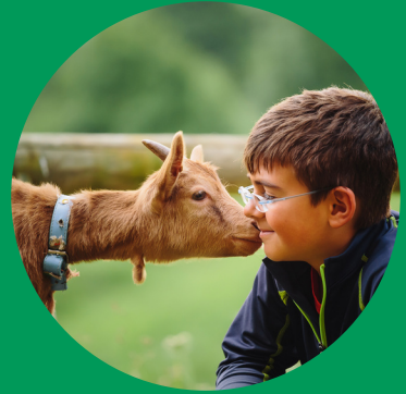
Goats- many types