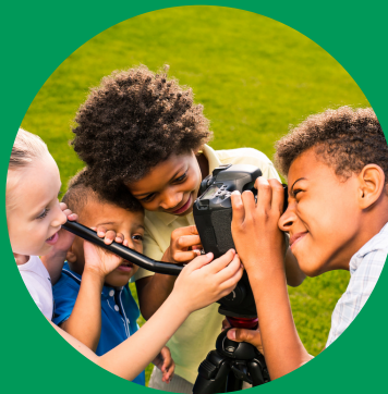
Photography & Filmmaking