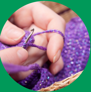
Crochet and Heritage Arts