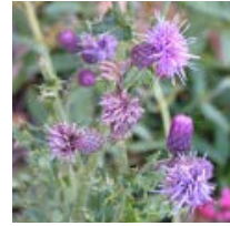
Canada thistle Cirsium arvense