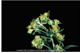
Leafy spurge Euphorbia esula